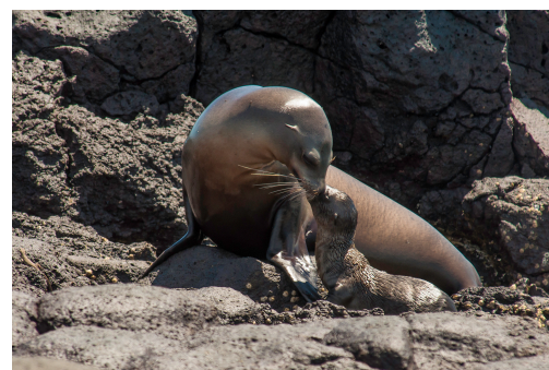
GALAPAGOS SEA LIONS