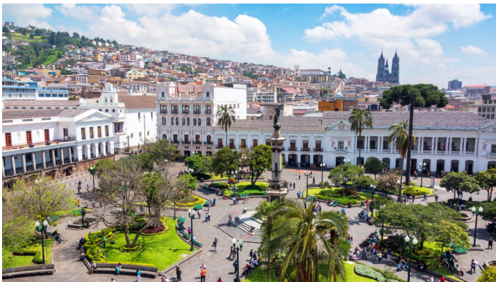
Photo: Plaza in Historic Quito