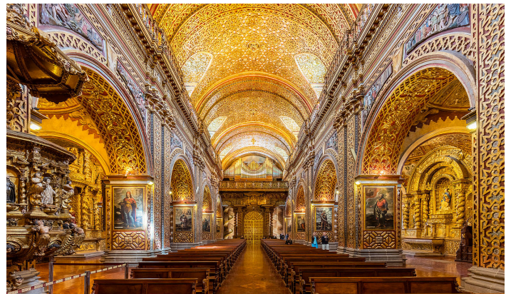
Photo: Inside the Church of the Society of Jesus