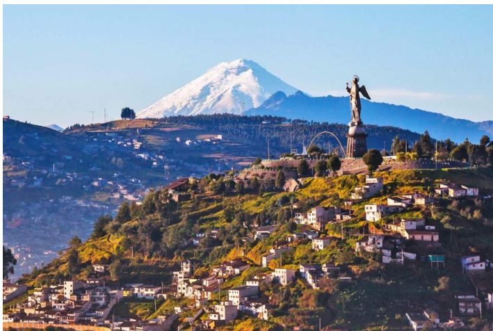
Photo: Panecillo viewpoint and volcano.