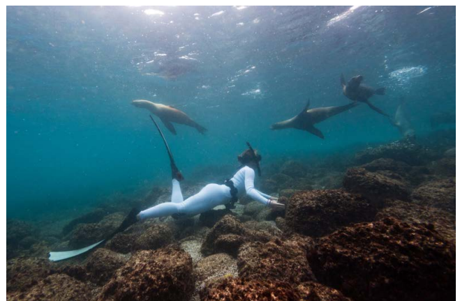
Snorkeling with Sea Lions on Santa Fe