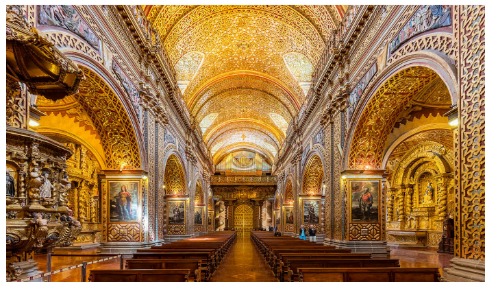
Photo: Inside the Church of the Society of Jesus