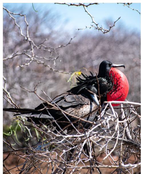
Magnificent Frigatebirds on North Seymour Island.