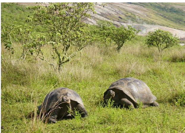
Galapagos Tortoises on Santa Cruz.