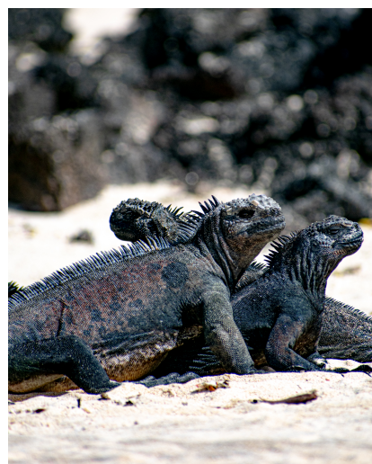
Galapagos Penguins & Marine Iguanas.