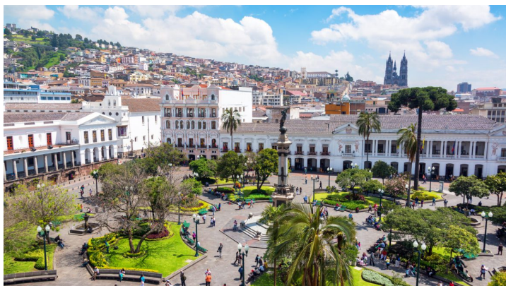
Photo: Plaza in Historic Quito